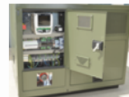
Cure4Water 200-Gallon Atmospheric Generator