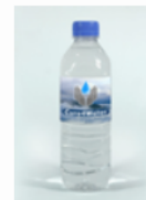
Cure4Water Blue Sky Label