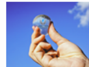
Cure4Water Biodegradable Ball Containers