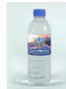
Cure4Water Mountain Label